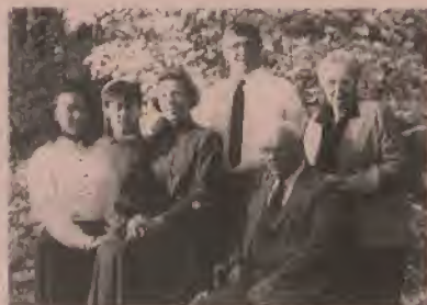
A Family Committed to Your Enjoyment